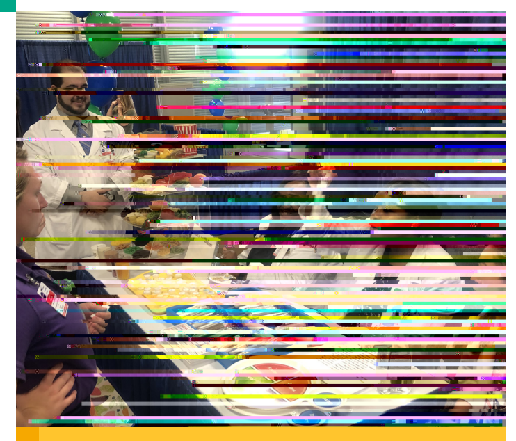
College of Pharmacy students volunteer for the Health